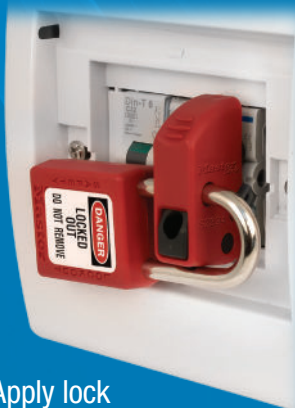
Apply lock horizontally