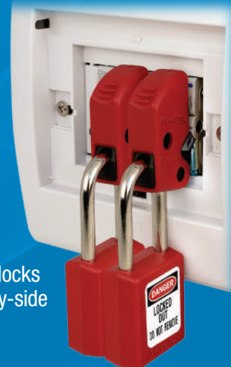
Apply locks side-by-side