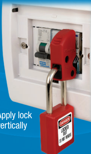
Apply lock vertically