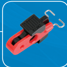
S2392 – Fits breakers with pin-in toggles