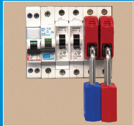
S2394 mounted side-by-side on adjacent miniature circuit breakers locked out with 410s.