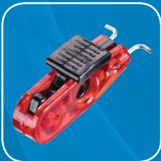
S2390 – Fits pin-out breakers 11mm or less