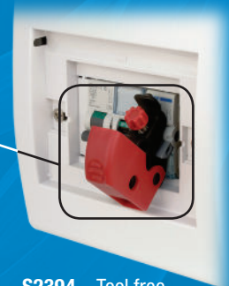
S2394 – Tool free universal fit