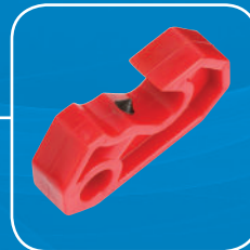
S2393 – Fits universal breaker toggles